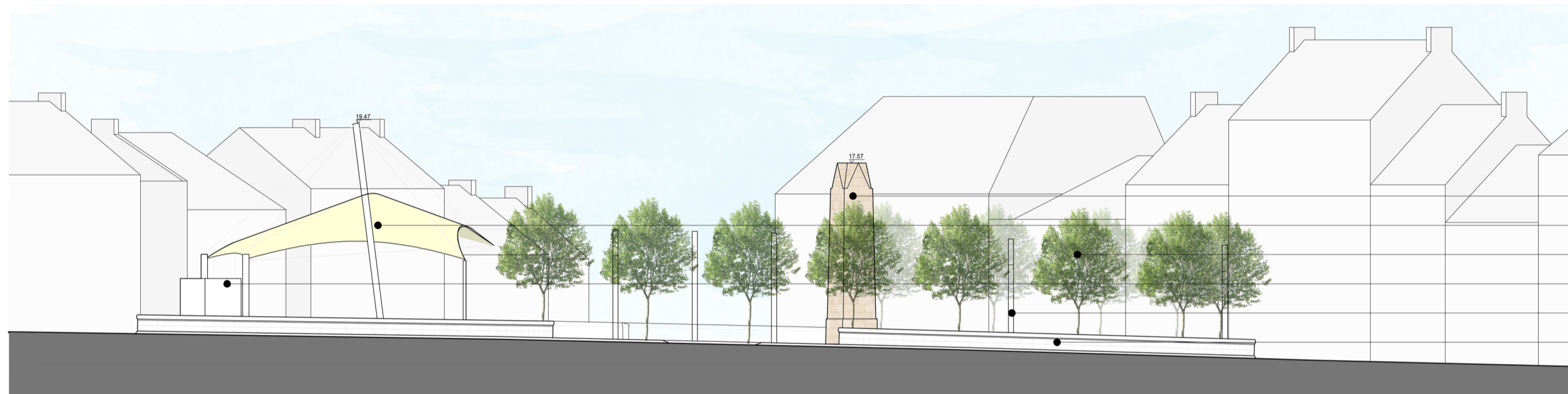
WEST ELEVATION SCALE 1:200