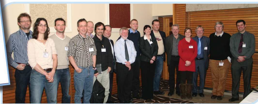
Conference Contributors and Proceedings

As promised in our last newsletter, we have now published the proceedings of the International Freshwater Pearl Mussel Meeting held last spring in Letterkenny on our website. They give a comprehensive indication of the range of work and measures being taken in pearl mussel