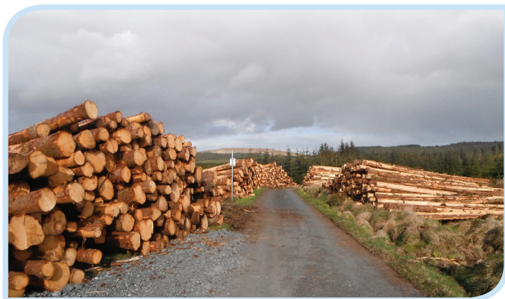
Felling Activities being monitored in the Davagh Forest

Many of our original tasks are also just about completed and the team are now entering a phase of preparing final reports. Close consultation with the project promoters, NIEA and Donegal