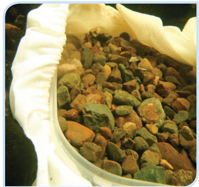
Monitoring sediment deposition in River Channel and Drain Cleaning