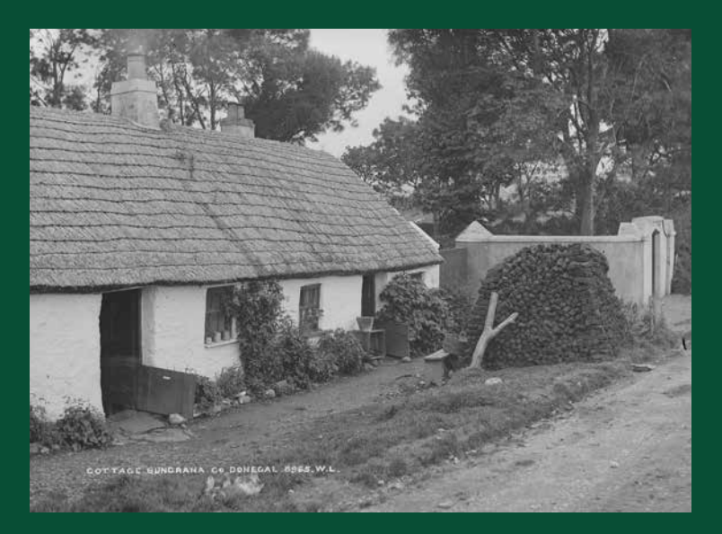
Third-Class House Buncrana