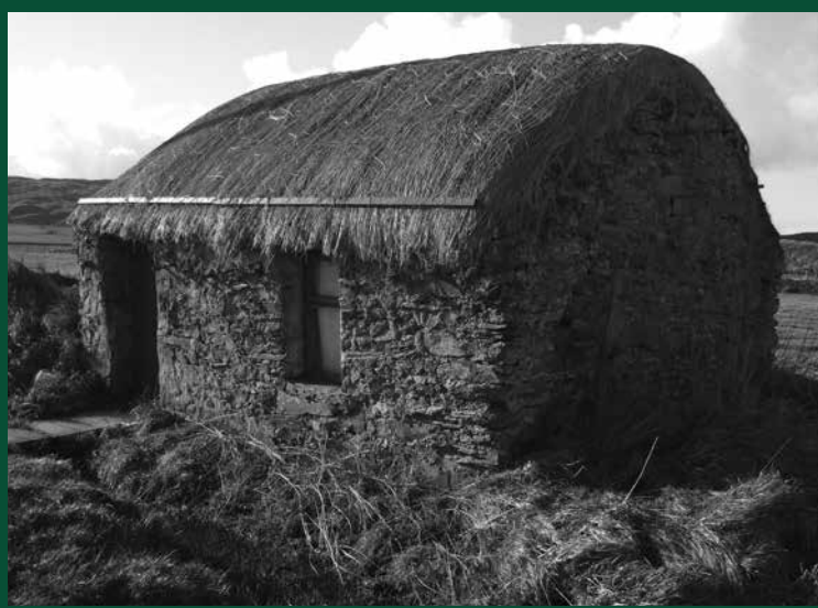
Fourth-Class House Isle of Doagh