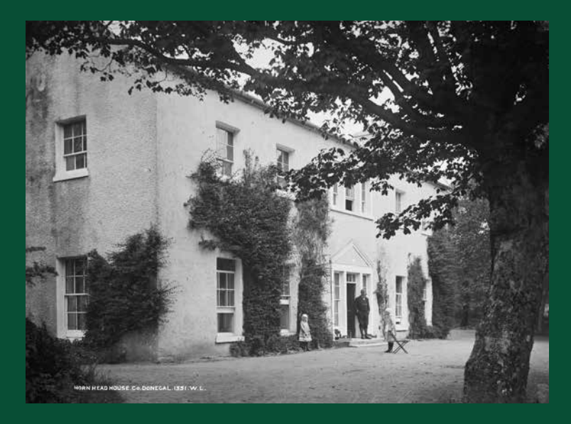
First-Class House Horn Head House, Dunfanaghy