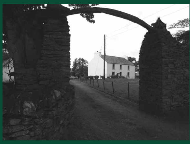
Second-Class House Cashel, Gortahork